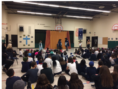
Carnival at SPR – Bilingual Theater Performance