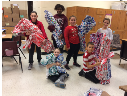
More milk bag mats ready to be shipped to Africa

All visitors must request entry to the school, by pressing the buzzer. Your patience at these times is appreciated. As a reminder: • When dropping off lunches, enter the school, label your child's lunch using a marker and please do not linger waiting to see your child at the front entrance. • Do not open the door for other visitors. They must buzz in and be allowed access by school staff. • Please know that the doors will NOT be opened during Opening Prayers and National Anthem. Thanking you in advance for assisting us with the implementation of the Safe Welcome Program.