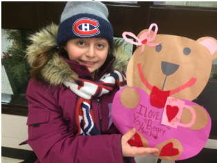
Valentines at St. Peters

Please note INDOOR and OUTDOOR Yard Supervision begins at 8:15am. If your child arrives at school prior to this time, he/she is unsupervised. In the interests of safety, your child should arrive between 8:15 and 8:30 am. Do not wait until 8:30 am and get caught in the traffic congestion and rush to be on time.